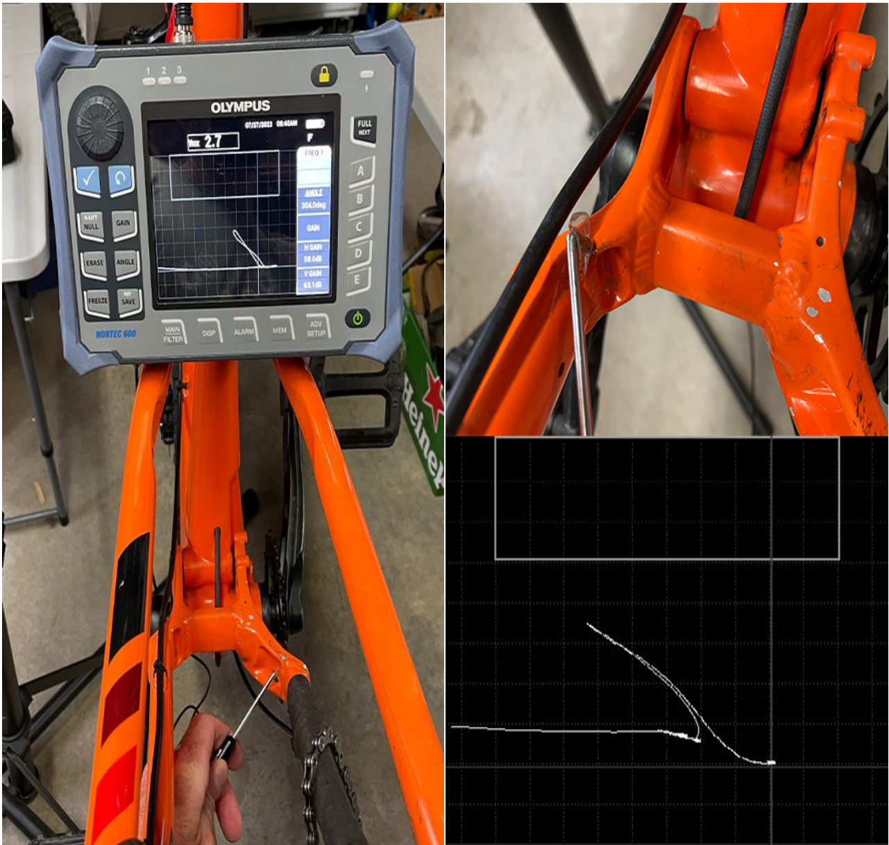
Eddy current scan of a cracked area on a bicycle frame using the NORTEC 600 eddy current flaw detector.